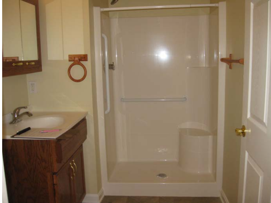
Four Foot Shower with two grab bars