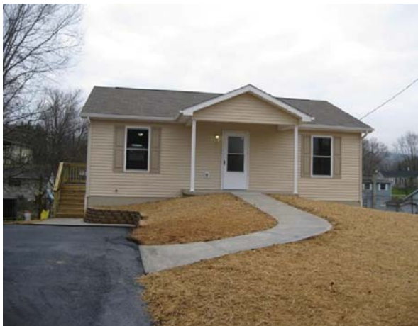
Accessible Walkway Entrances: