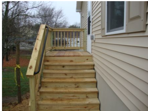
Handrail along guardrail