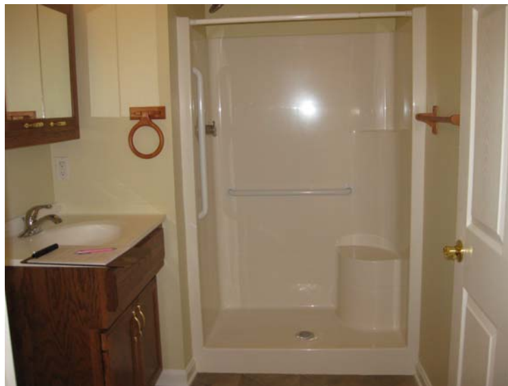
Four Foot Shower with two grab bars