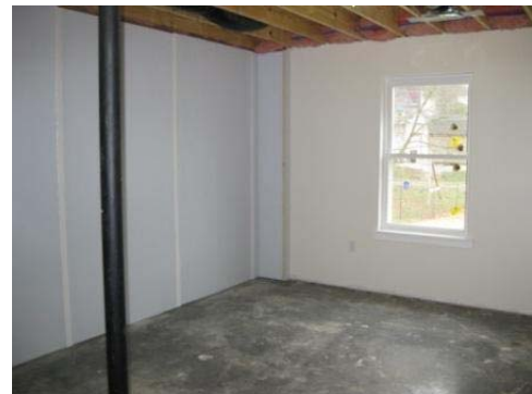
Fire rated insulation in basement