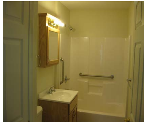
Grab bar next to toilet and in tub (note: white grab bars are preferred)