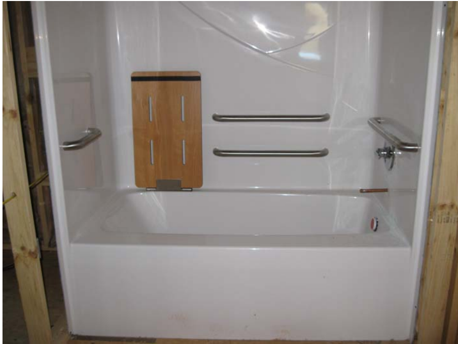
ADA Compliant Bathtub