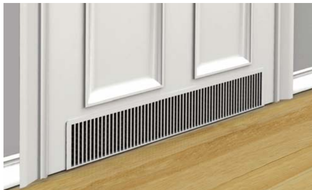
Tarmack Perfect Balance Return Air Pathway