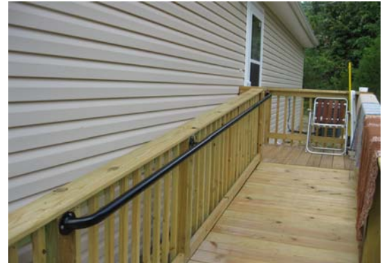
Handrail along ramp